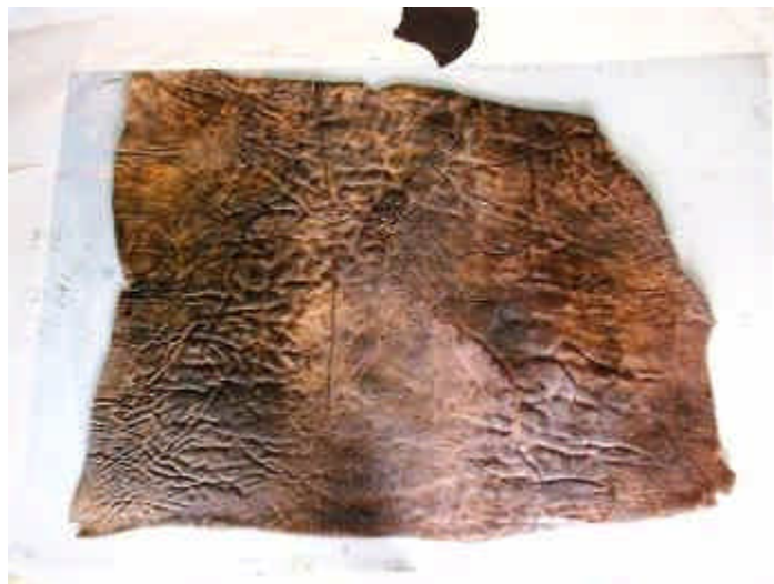
Jake Cruzen's Ancient leather map

Sunday morning brought the wind and of course the big hunts. There was a real light turnout as compared to other FMDAC hunts. We had only around 68 hunters for the hunts but the ones that were there were not disappointed.