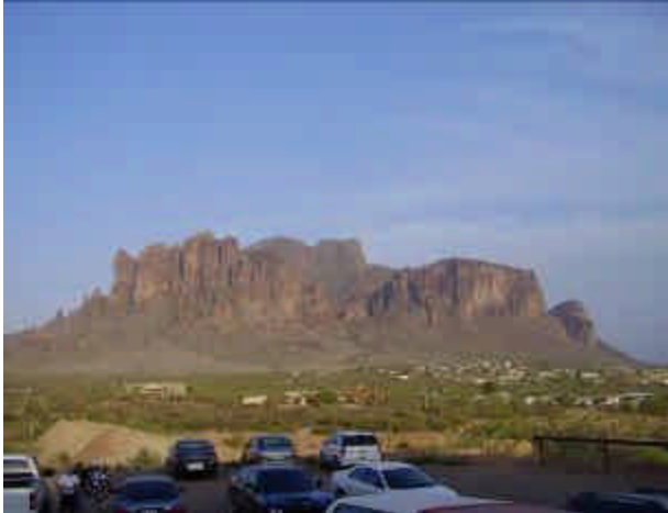
SUPERSTITION MOUNTAIN BEHIND GOLDFIELD