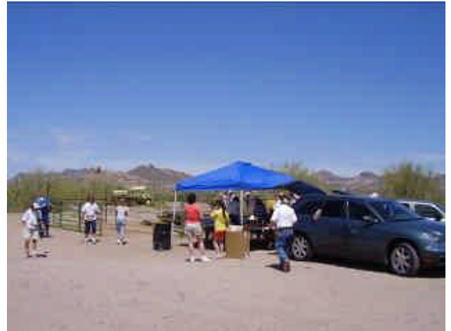
DELUXE REGISTRATION AREA!